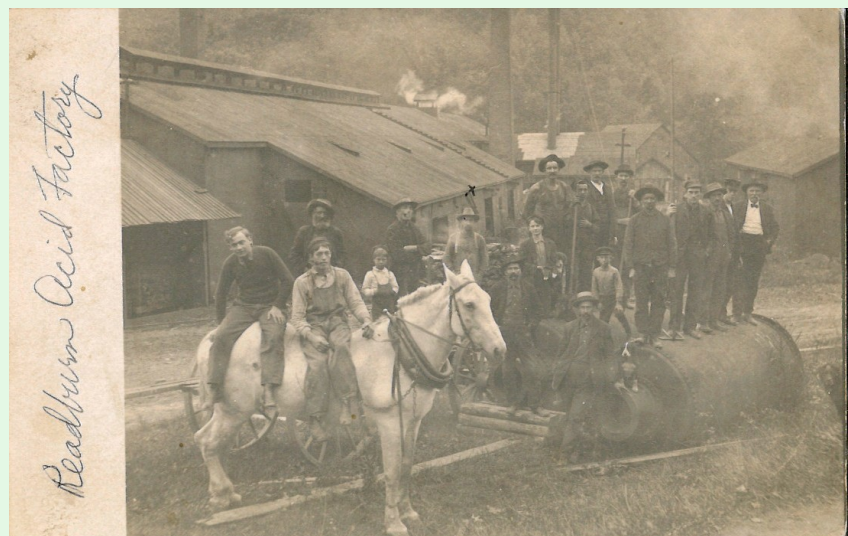
Readburn Acid Factory

Men and women, and sometimes, even children, shared equally in production for this subsistence economy. On local farms, men and boys tended to the larger livestock, while their female counterparts maintained the household